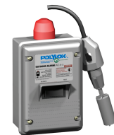
Outdoor SmartFilter® Alarm Polylok, Zabel & Best filters accept the SmartFilter® switch and alarm.